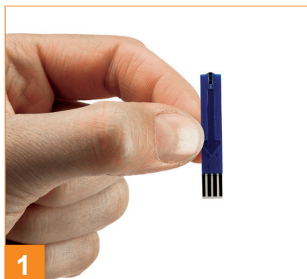
1 Remove test strip and place into analyser.