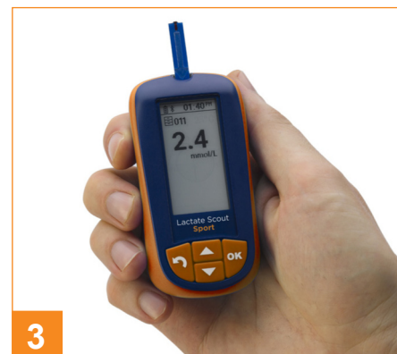
3 Result appears in 10 seconds.