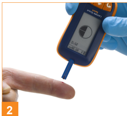
2 Prick finger and collect blood by touching with test strip.