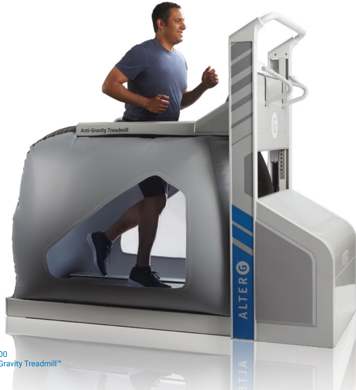
FIT 100 Anti-Gravity Treadmill™